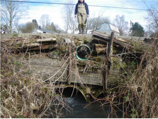
Badger Creek Fish Passage Barrier