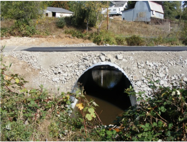
Badger Creek culvert replacement