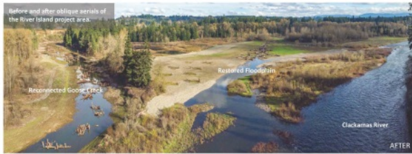
River Island - Goose Creek Before/After