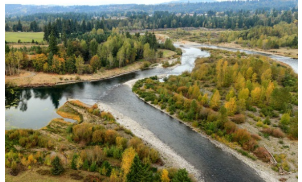
Metro's River Island Natural Area